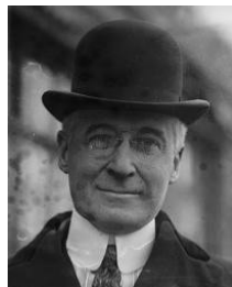
(left, Bernard Baruch, 1870-1965)

Ninety per cent of the funding for "American Jewish League Against Communism" came from Rothschild front-man Bernard Baruch.